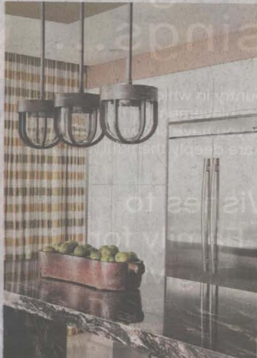
DESIGNER'S VISION: Elle Decor Showhouse kitchen by Wade Allyn Hallock.