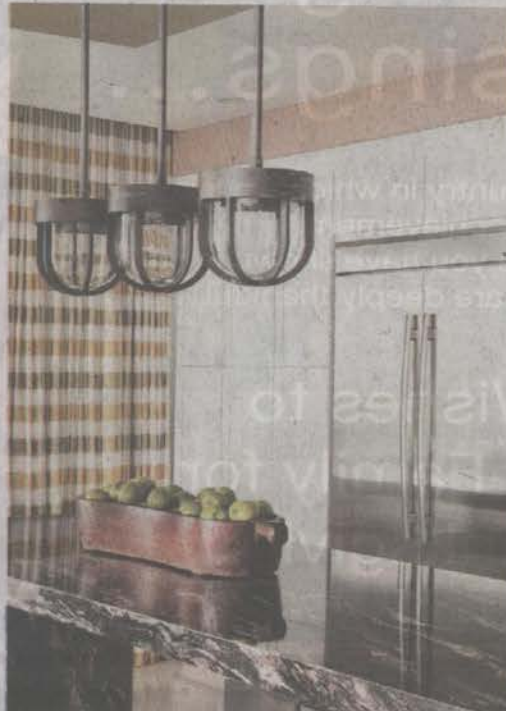
DESIGNER'S VISION: Elle Decor Showhouse kitchen by Wade Allyn Hallock.