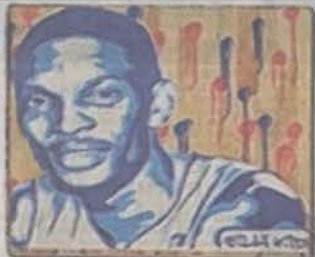
BILLI KID: 'The Art of Basketball' features images of Dwyane Wade and Chris Bosh on tables made from pieces of the 2011 NBA All-Star Basketball Court.