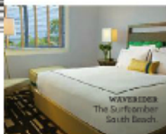
WAVESEDER The Surfcomber South Beach

or under the age of 18 and include everything from sports facilities to a library lounge. There are five two-bedroom floor plans to choose from among the three-season cottages. The last phase of cottage construction is currently underway. The newest phase broke ground in August 2011 for a limited number of four-season cottages, consisting of six floor plans of approximately 640 square feet. Pricing from $180,000. seaglassvillage.com