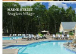
MAINE STREET Seaglass Village

or under the age of 18 and include everything from sports facilities to a library lounge. There are five two-bedroom floor plans to choose from among the three-season cottages. The last phase of cottage construction is currently underway. The newest phase broke ground in August 2011 for a limited number of four-season cottages, consisting of six floor plans of approximately 640 square feet. Pricing from $180,000. seaglassvillage.com